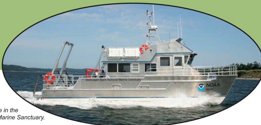
The 48' R/V Auk will operate in the Stellwagen Bank National Marine Sanctuary.