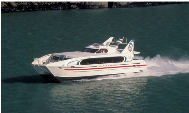
The Chilkat Express is known as the fastest boat of its kind in its region, cruising at over 40 knots.