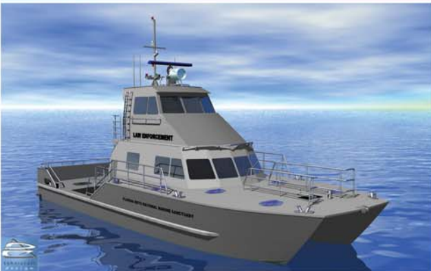
The 53' high speed catamaran will operate in the Tortugas Ecological Reserves and the Florida Keys National Marine Sanctuary.