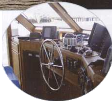
The helm station

The vessel's Teknicraft design is known not only for its speed for the horsepower and low wake wash, but also for its sea-keeping ability and comfortable ride, even in rough seas. "A typical day for us in