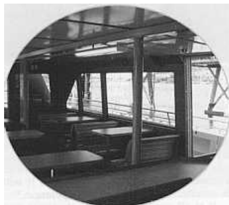
Functional interior fitout

Twin Disc MG 5114A SC marine gears with 2.5:1 ratios turn five-bladed 36x42-inch Osborne propellers on three-inch Aquamet shafts, and a pair of Onan 20kW engines serve as auxiliary backup. During