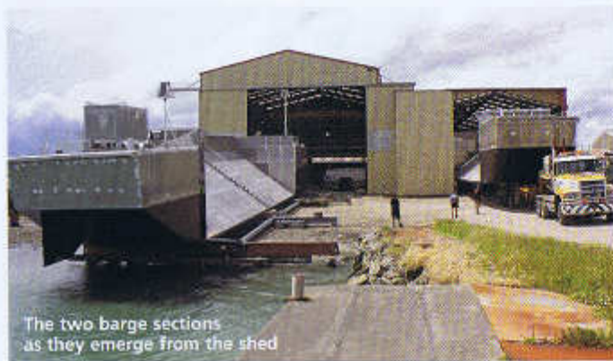
The two barge sections as they emerge from the shed

There has always been a good supply of smaller tugs and digger barges from the local workboat sector to do this sort of confined space work and while maintenance dredging is by its nature regular, there has not been a reliable supply of the right