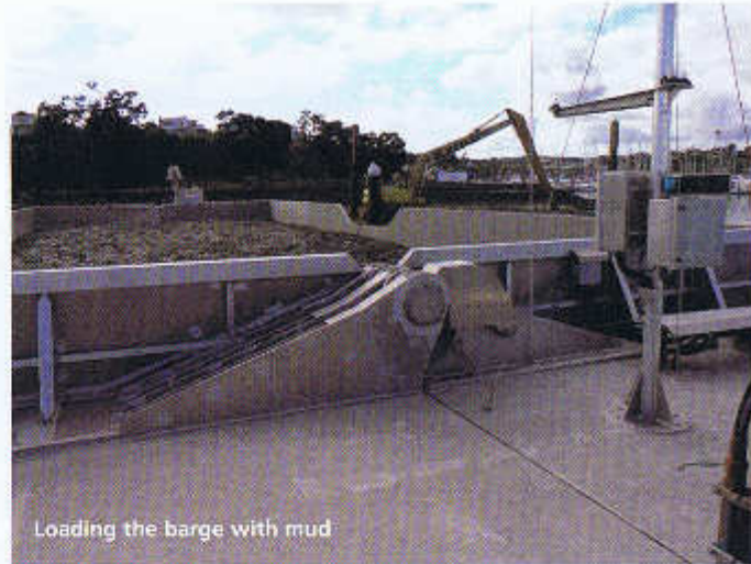
Loading the barge with mud