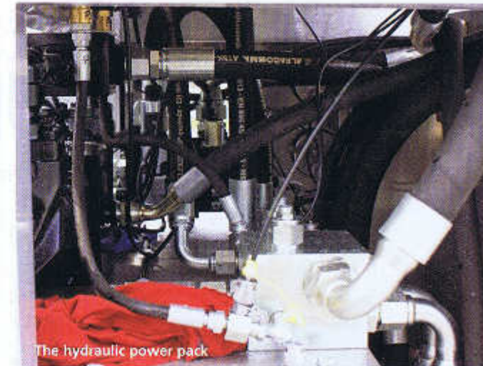
The hydraulic power pack

Clearly, the flat bottom nature of the barge slides well, even when loaded with 1000 tonnes of wet gooey spoil. Once empty the 80 tonne lightweight barge becomes lively again, but makes for an easy lightweight tow as long as there is a substantial vessel in charge upfront. The trap for young players would be to attempt such a long tow into open water and varying sea conditions with a lightweight tug, even if it had coastal survey limits. I can well recall my earlier experience when as a young tow boat master I bit off a bit more than I could chew on Auckland's harbour in a very stiff northerly with a loaded barge in tow and could not stop my track astern. Embarrassing yes, fortunately help was at hand in the form of a port tug who hauled us clear of danger just as the squall abated. Was my foo-foo valve puckering? Of course it was, but a lesson was learnt with no damage.