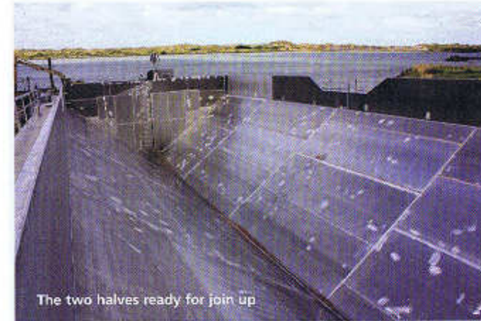
The two halves ready for join up

sized split hopper barges suitable for a long open passage to an approved dump site. This is partly due to the resources boom in Australia taking up a lot of the existing vessels and Maritime New Zealand calling an end to its old disposal site east of Cuvier Island.