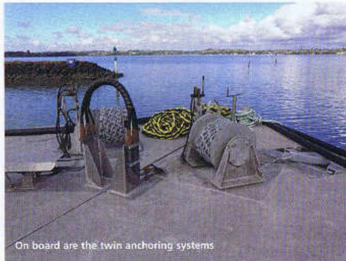
On board are the twin anchoring systems