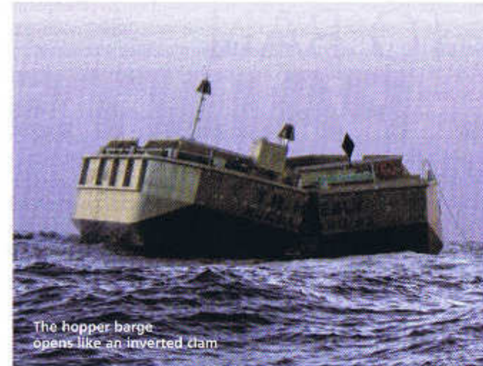
The hopper barge opens like an inverted dam

As the barge is nearing or is on station the motor is started remotely and allowed to run for 10 minutes to warm up and build up hydraulic pressure. Once the dump is triggered and